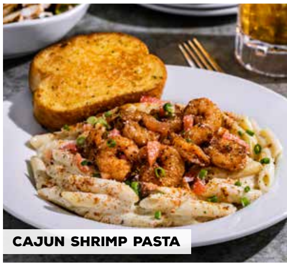
CAJUN SHRIMP PASTA