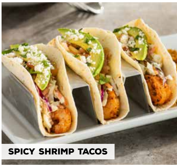
SPICY SHRIMP TACOS