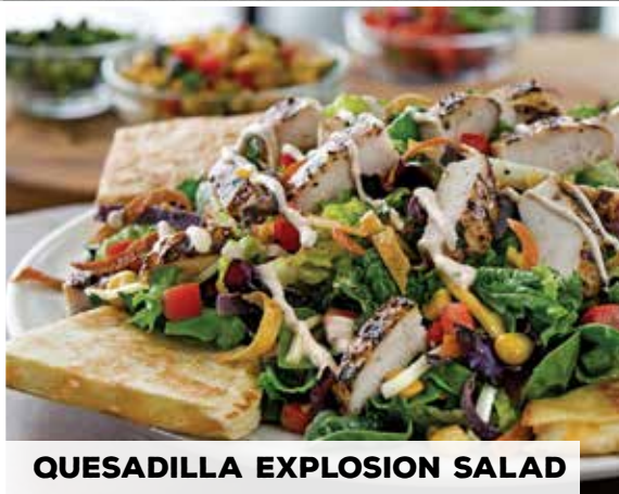
QUESADILLA EXPLOSION SALAD