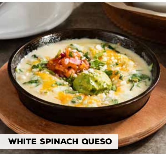
WHITE SPINACH QUESO