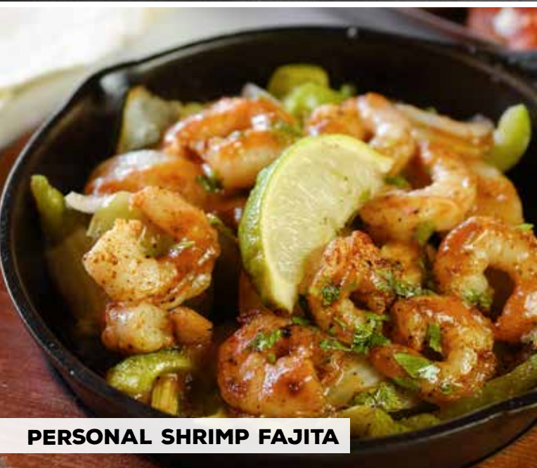
PERSONAL SHRIMP FAJITA

Seared chile-rubbed Atlantic salmon, spicy citrus-chile sauce, cilantro, queso fresco. Served with fajita rice & steamed veggies. 23.99